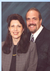
Joseph Sprowl Ministries